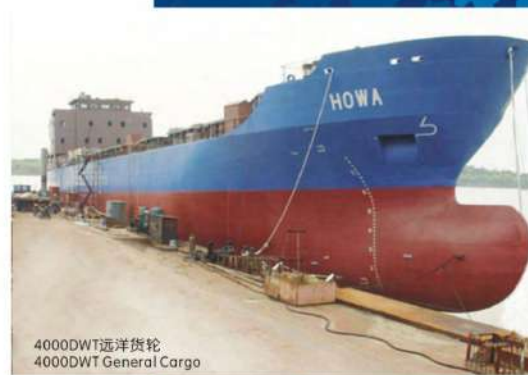
4000DWT远洋货轮 4000DWT General Cargo