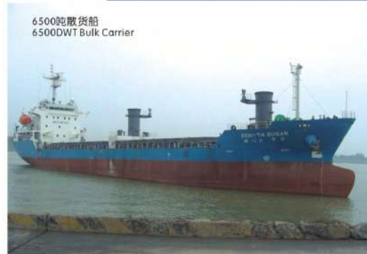
6500吨散货船 6500DWT Bulk Carrier